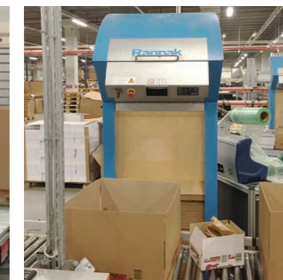
Voidfilling the remaining empty space