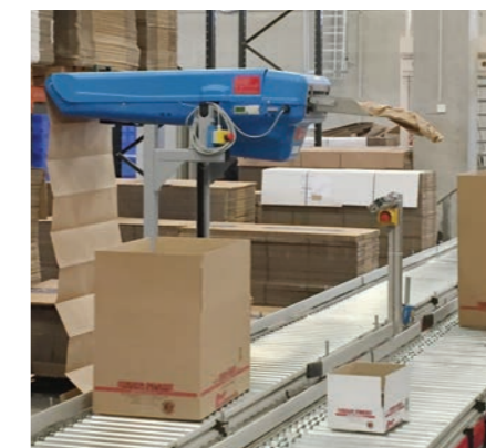
Paper pads offering protection in-line