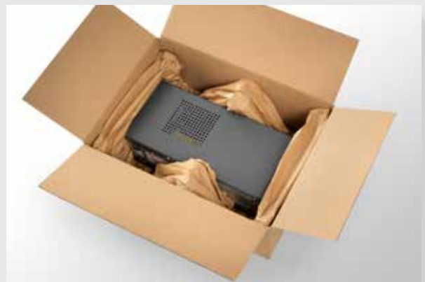
BLOCK AND BRACE